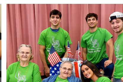
Friends from Fordham Prep with the Residents