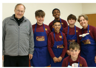
Volunteers from Iona Prep