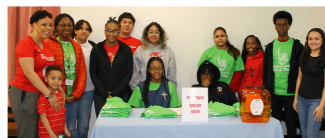
Rocking team from Cardinal Spellman High School