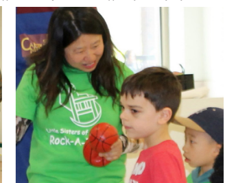
Friends and family enjoyed the day.

Pope Francis emphasized the importance of intergenerational relationships when he said, "How I would like a new embrace between young and old!"