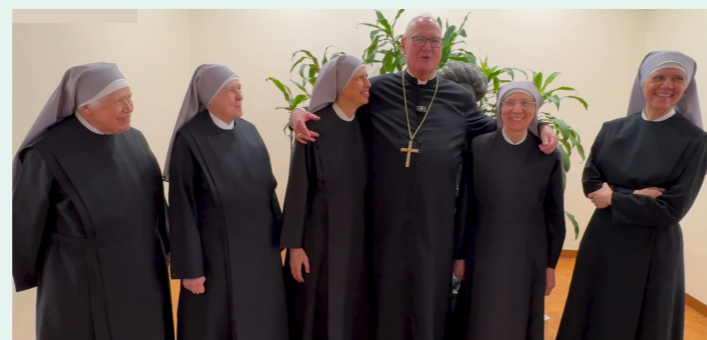
Cardinal Timothy Dolan celebrated Mass in our Chapel on May 1, the feast of St. Joseph the Worker.