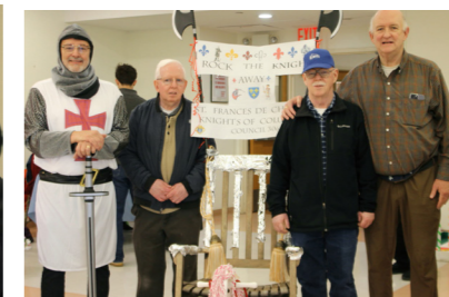
Knights of Columbus "Rocking the Night Away"