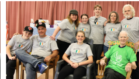
The Donegal Travelers